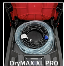
DryMAX XL PRO

Wrap the power cord slightly tighter so that it fits inside the condensate hose.